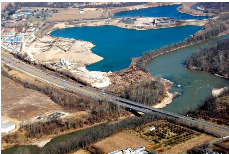
Present-day gravel mining pits border the Great Miami River near the U.S. 27 bridge at the Butler /Hamilton County line.

Friends of the Great Miami are concerned about past and present land uses along the river. We seek more members to help us find a reasonable balance among the competing demands for the river's natural resources. The Great Miami is a treasure of unrealized potential for recreation. Its vast aquifer system is a source of fresh drinking water for more than a million people in Southwest Ohio. The river corridor serves as a major flyway for migratory birds while providing precious wildlife habitat to a diversity of native plants and animals. If you would like to join, please fill in the blanks below and send the information along with membership dues to: P.O. Box 141482, Cincinnati, Ohio, 45250-1482.