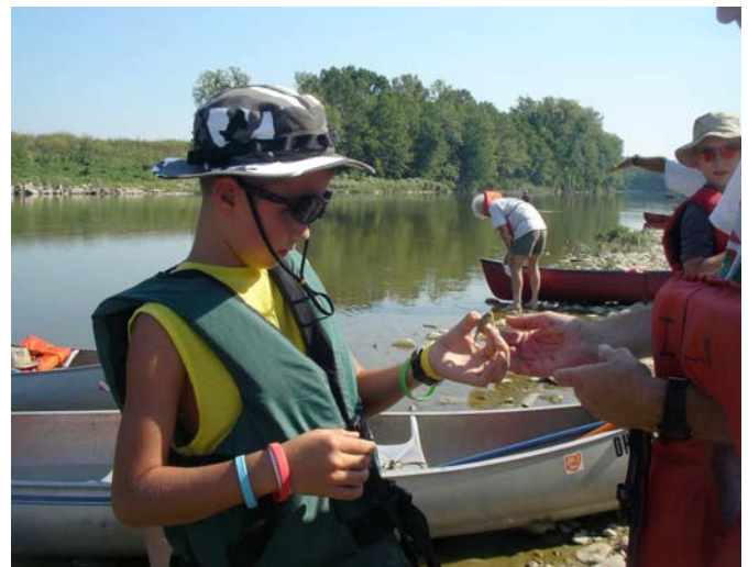
This young naturalist hands off a toad he discovered during an educational canoe outing with Friends of the Great Miami.