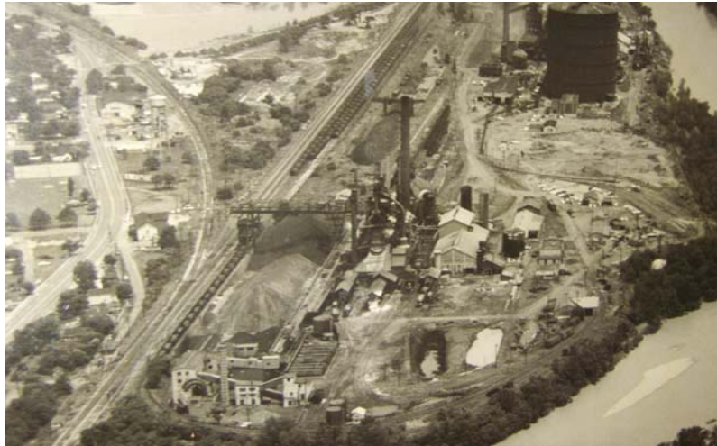
During the last century, Armco operated a coke and steel plant next to the Great Miami River at New Miami.